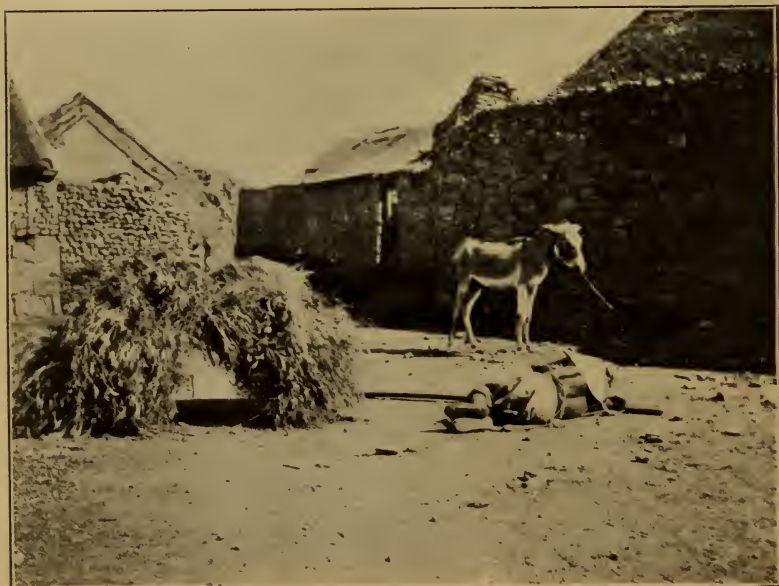
AN AFTERNOON SIESTA.